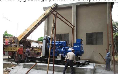
Generator installation in Homs city (UNICEF, 2013)