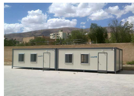
Semi – permanent classrooms at school hosting displaced children in Adra area of Rural Damascus

Out of the 104 procured semi-permanent classrooms, 12 were delivered to school sites used as IDP shelters in Rural Damascus (10 units) and Damascus (2 units). Installation is nearing completion for a capacity on 420 children. The remaining units will be installed shortly in other areas in Rural Damascus, Damascus, Homs and Tartous.