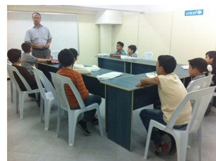
Adolescents ToT in Homs (UNICEF, 2013)

In Homs, through UNICEF's Adolescent Development Programme and in cooperation with a local NGO, UNICEF continues to train adolescent boys and girls as trainers for participation and life skills. During the reporting period, 30 adolescent boys and girls completed ToT round one. 30 others are now attending a second round. 132 girls and boys started attending a three month session for English remedial classes and sports 3 days a week. 80 adolescents started life skills and English courses. UNICEF in cooperation with other NGOs completed a distribution of Clothing, Shelter and Cooking kits which targeted 5,350 households (26,750 IDPs) and children 3-15 years of age living in unfinished buildings in rural Damascus.