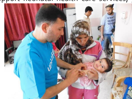
National vaccination in Deir el zor (UNICEF, 2013)

Nutrition: Following training of partners on MUAC rapid assessment, Syrian Arab Red Crescent (SARC) undertook an assessment in its clinics in Damascus over a sample size of 235 under-five children. The percentage of global acute malnourished children screened is reported at 14.4 %, while 8% is reported as moderately malnourished, and 6 % severely malnourished. Although limited in scope, results are alarming and confirm the deteriorating nutritional status of children.