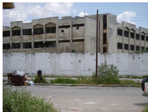
A damaged school in Baba Amer (UNICEF, 2013)